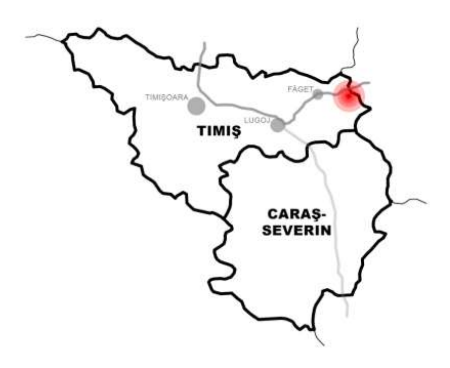
Figure 1. The location of Crivina de Sus within the Banat region.

study the cemeteries of Banat, with a grant from AFCN, a division of the Romanian Ministry of Culture. The team, formed by 3 architects, 3 landscape architects and an anthropologist, arrived in the picturesque village of Crivina de Sus. The village emerged in the valley of the Bega river, a remote location, surrounded by hills and luxuriant woods. On top of one of these hills, there stood, majestically, Banat's presumably oldest wooden church: Saint Paraschiva from Crivina de Sus. The cemetery was literally a jungle and it was difficult to distinguish the beautiful wooden crosses sourrounding the church. The community shifted to Neo-protestantism and buried their loved ones in a cemetery nearby. The church was in decay as well. Since it rained inside, the religious service was moved in a small room in Caminul Cultural , a building of all-purposes in the village, near the school.