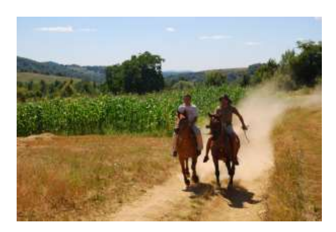
Figure 3. "Going Native", bounding with the local community, while exploring the natural landscape, 2013.

Every new workshop pushed the team, much enlarged, to become friends with many people from the community and finally reached decision makers: the administration and the church. In February 2017 a new milestone was reached when the main team, together with the Banat Metropolitan Church organized a conservation class for the priests serving in a wooden church. It was a down-to-earth, good practice presentation on how to protect the church, it's environment and the interior, showing that day to day use and maintenance could prevent expensive restoration works later. Most of the churches in Banat are abandoned, being mostly used as funeral chapels, since the majority of the villages have new churches. Sometimes, something as basic as airing the church and holding service inside could substantially prologue the life of the monument.