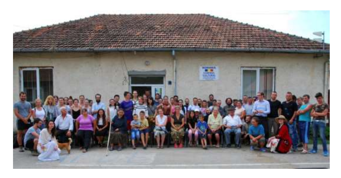
Figure 6. The community and the workshop participants in 2016

Possibly the most important component is the educational one: for the future professionals, the local community and the general public this type of approach should be a milestone. The project wants to offer a methodology on preserving this very fragile type of heritage, focusing not only on the architectural object but also on the landscape, local community and shared history. Furthermore, the project aims to slowly move to other churches in the area and discover their understudied history, and maybe build a guide on how to approach other churches in Banat and Romania.