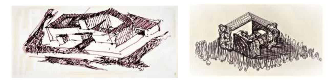
Figure 2. One of the first sketches, with the potential of the second stage on the extended site (3) / One of the last sketches with the actual proposed building (3)