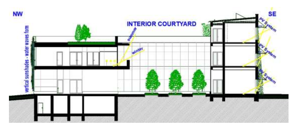
Figure 4. Section with metal structures designed for actual horizontal sunshades and a potential future photovoltaic system on the South-East elevation and vertical sunshades on water waves form on North West elevation (2)

The structure for 55 photovoltaic panel that are designed to be inserted in the next future is done in PVSyst version 6.64 [10] for the preliminary design stage.