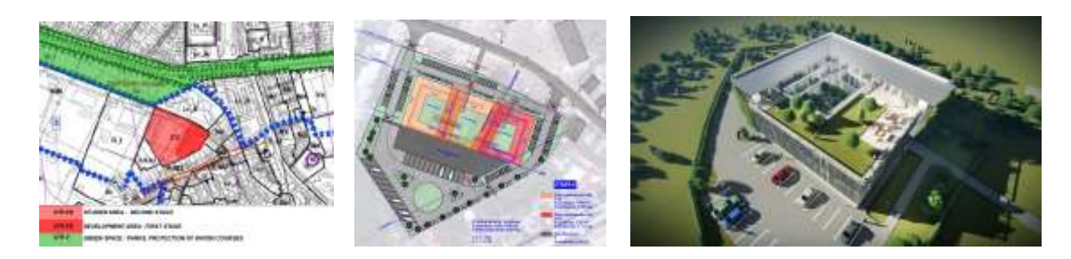
Figure 1. Urban planning regulations: red colored is studied area, green colored water course protection area (1) / Site plan of the second potential stage (2) / Render with the development from the first stage (4)

The building studied is an administrative building of the Local Public Company of Water Management from Oradea city, Bihor county [8]. The water waves form inspired by the representative function and also the small river named "Peta" from that area of the city. It's an industrial area not closer to the center of the historic city. The identity is preserved in the courtyard form of the building, not in the image of some traditional construction materials.