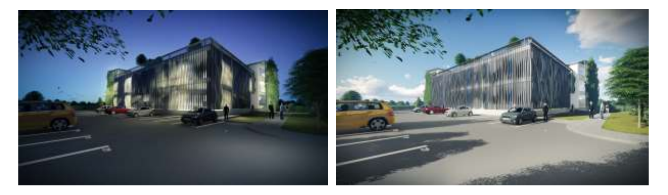
Figure 3. Night render / Day East elevation render: both image include vertical sun shading system from East sides of the building with the water waves form (4)

Figure 2. One of the first sketches, with the potential of the second stage on the extended site (3) / One of the last sketches with the actual proposed building (3)