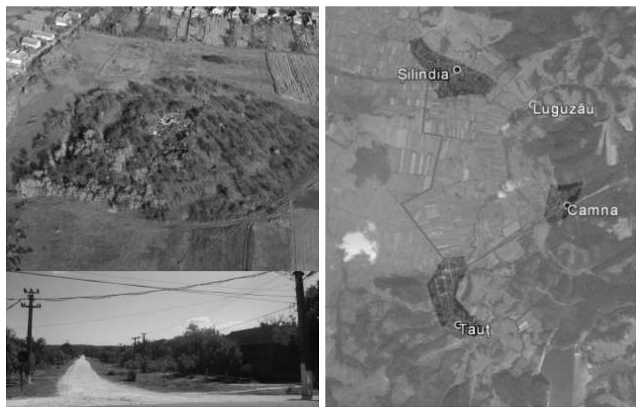
Figure 2. The non-corporeal heritage in Taut – present state of the ruin and the country road to Camna. Right, a possible approach for musealisation of the non-corporeal heritage in the region.

Even though there are many unverified pieces of information in these local legends combined with archaeologically proven facts, the rich non-corporeal monument in Tauţ is incontestable. If musealisation was to happen here, the whole Tauţ-Şilindia-Camna area should be taken into account and included in the same masterplan (Fig.2).