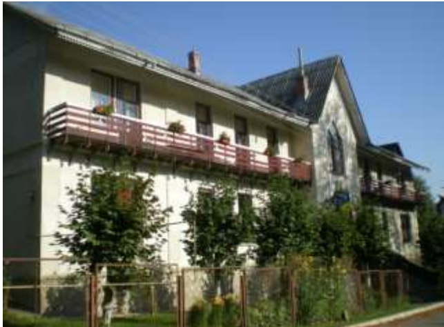
Figure 10: Carol Hotel

At the moment, Oglinzi Baths resort offers only basic tourist services: accommodation and dining. The tourist entertainment is poorly represented in the resort's offer and the balneology, which could be the main motivation to increase the occupancy of the resort, is nonexistent. The use of chlorosodium water from Oglinzi – Târgu Neamţ is the condition and the chance for the resort to know the improvement of the financial situation and ensure the permanent functionality.