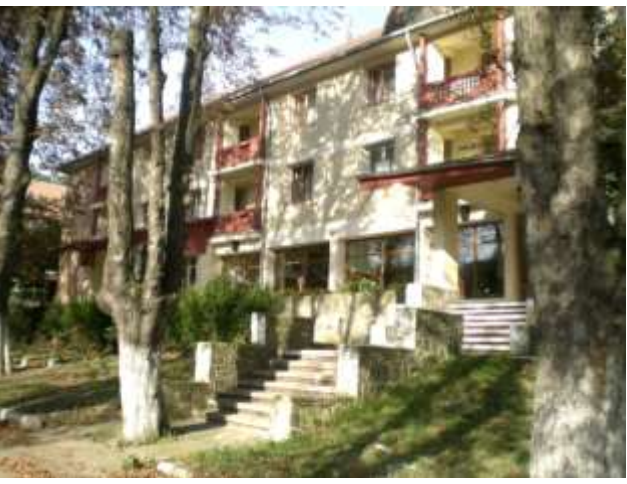
Figure 8: Pavilion A of the hotel, built in 1988