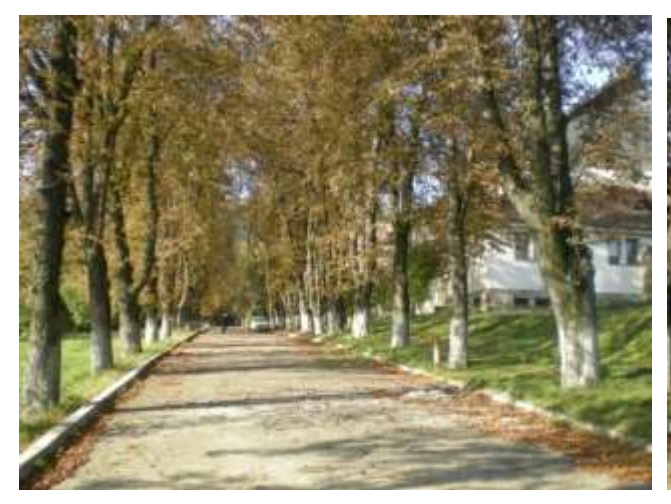
Figure 7: The alley in front of the hotel built in 1988 (pavilion A)

development was proposed for a longer period of time, tending towards a capacity of 1000 beds and modernization of the treatment base. [15]