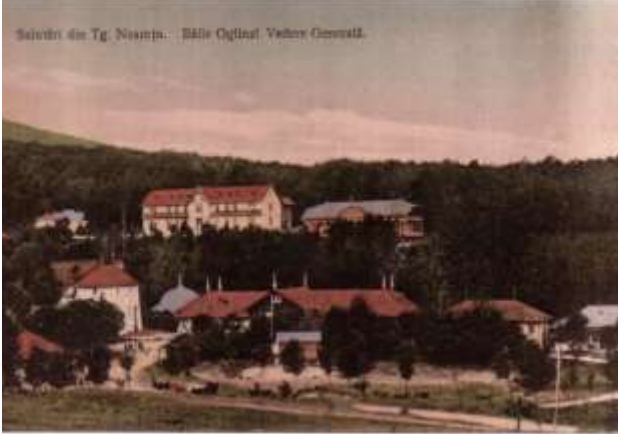
Figure 6: General view from 1927

In the period of World War II, the town was subjected to the bombing and the treatment installations were destroyed, the resort ceasing its activity.