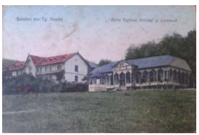
Figure 4: Carol Hotel and the former Casino

New publicity brochures were published in which Oglinzi Baths are considered to be "The Pearl of Moldova", with the front cover of Carol Hotel and the last cover with the Casino Restaurant building, inside the facades of the Creangă and Ferdinand Hotels and the Ella villa. Also, all necessary data on the composition of mineral waters and their curative value are presented in the treatment of rheumatic diseases, rickets, nerve diseases, bone diseases and specific feminine diseases.