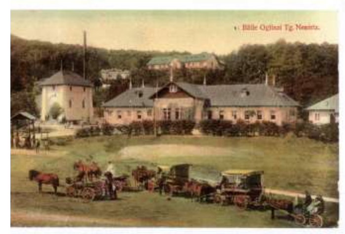
Figure 5: General view from 1922