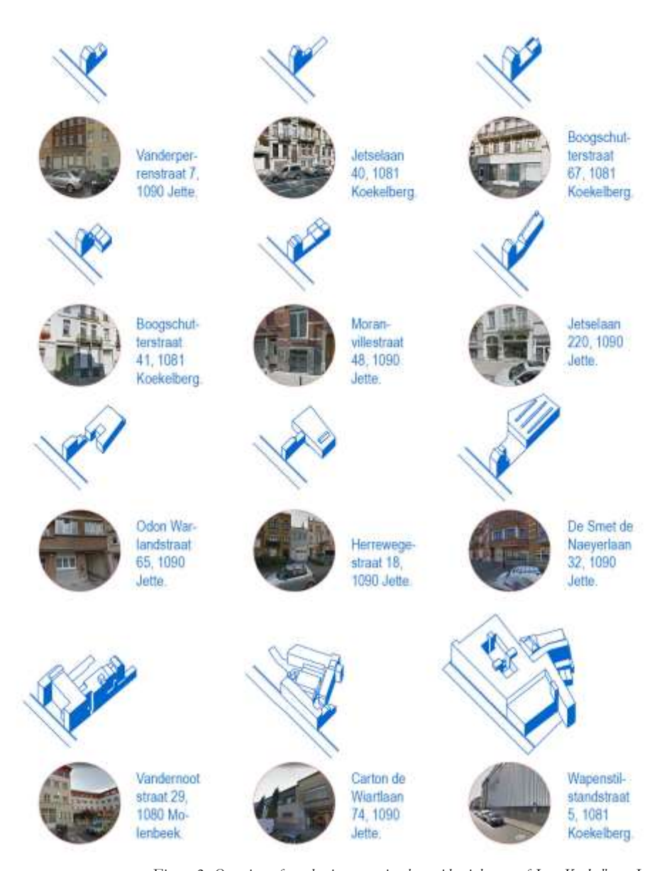
Figure 2. Overview of productive types in the residential area of Jette-Koekelberg.

A contradiction can be found in Aldo Rossi's elaboration on type and its determinacy. He namely argues types to be functionally indifferent and solely attributed to form and configuration. The hallway of a school, in his example, does not (typologically) differ from that of a student housing block [1], [6]. Contrarily, in his division on the urban level between types and monuments as the two constituting permanences of the urban fabric, he states the first to be housing and the latter functionally indifferent. The approach thus limits for the studying of mixed-use buildings of monumental importance in the urban fabric, excluding the undiscovered patrimony of, for example, SMEs.