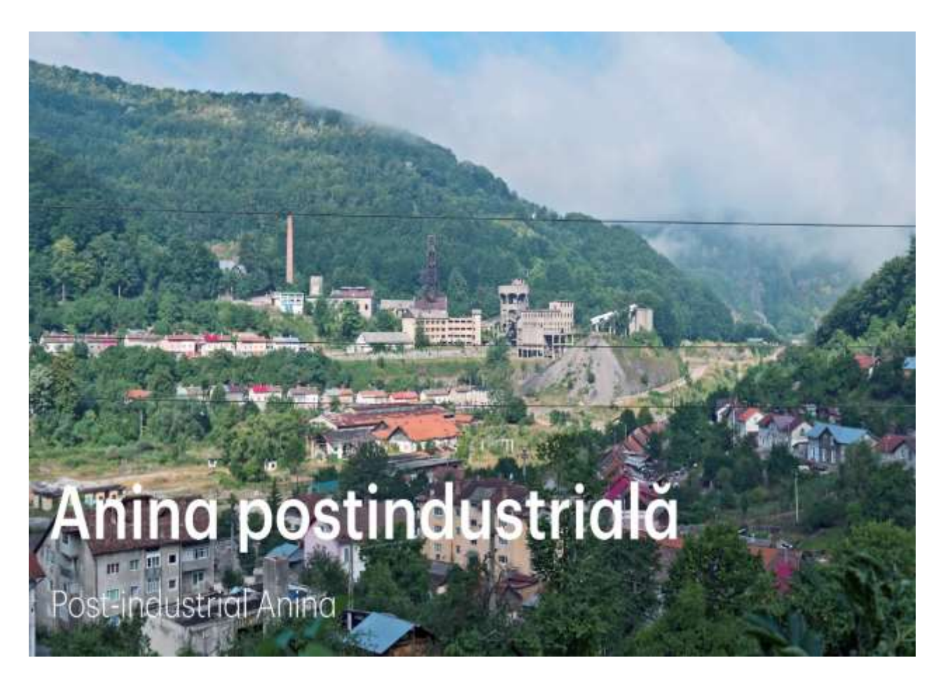
Figure 1. Anina [2]