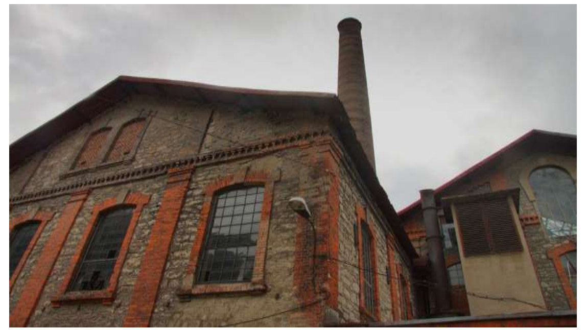
Figure 9,10. Museum of electric power station [14]