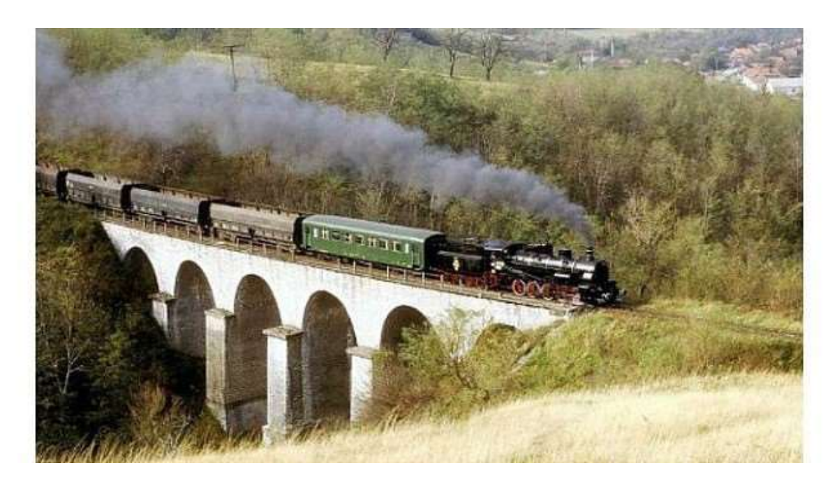
Figure 4. Banatan Semmering railway [4]

The town Anina can be accessed by road from Reşiţa on National Road 58 and from Oraviţa or Bozovici on National Road 57B. From Oraviţa, the city of Anina is linked to the oldest mountain railway in the country, also called Banatan Semmering due to its similarity in terms of constructional difficulties with the Austrian railway from Semmering. This mountain railway has a length of 33.8 km, a difference of 338 m, 14 tunnels and 10 viaducts, and is currently traversed in about 2 hours.