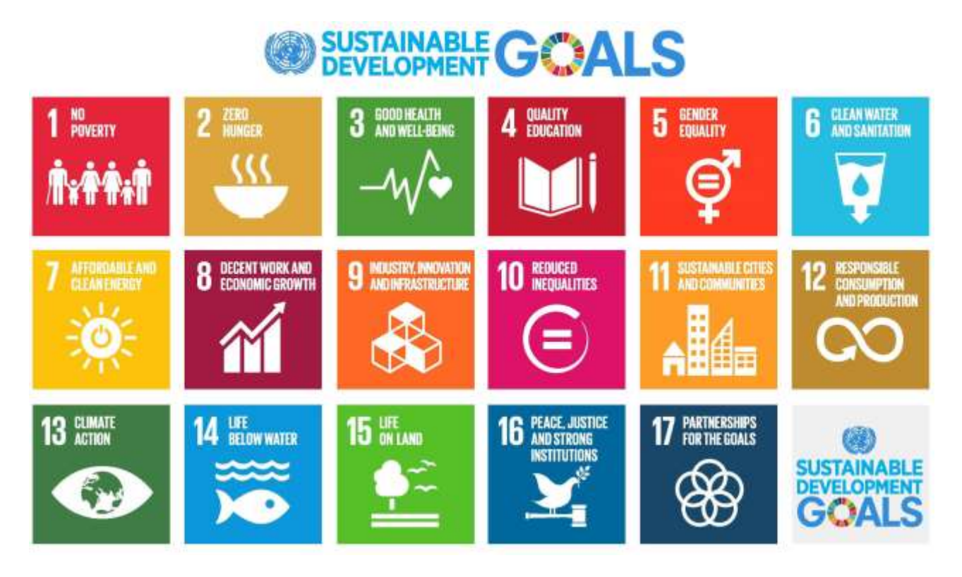
Figure 6. Sustainable Development Goals [8]

Sustainable development is first defined in " Our Common Future ", from 1987, also known as the Brundtland Report:: "Sustainable development is development that meets the needs of the present without compromising the ability of future generations to meet their own needs. It contains within it two key concepts: the concept of needs , in particular the essential needs of the world's poor, to which overriding priority should be given; and the idea of limitations imposed by the state of technology and social organization on the environment's ability to meet present and future needs." [7] The main idea is to ensure a balance between the socio-economic measures and elements of natural environment, without compromises the ability of future generations.