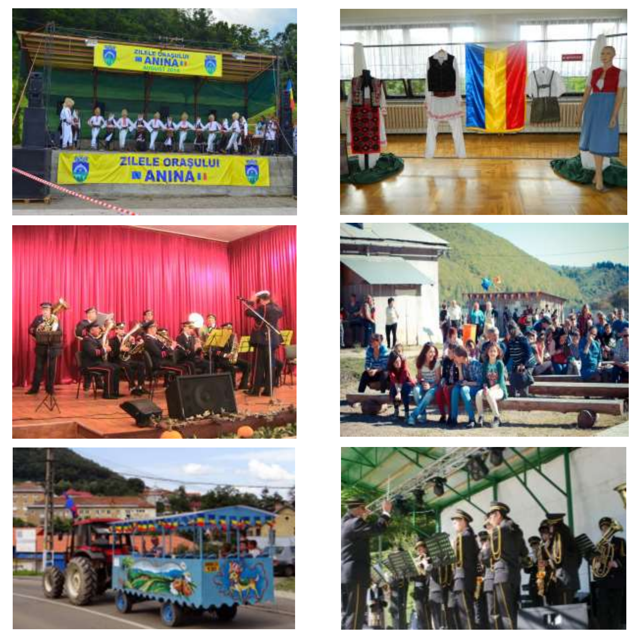
Figure 11, 12, 13, 14, 15, 16 Photos for cultural events [15]

There are a few investments in temporary architecture made for promotion of cultural events, like those for the Romanian and German traditionally dance and soloist group, for the concerts of the fanfare which is still a tradition and also investments in education for the school circles of painting and drawing. For recreational and leisure activities, the city's inhabitants have a network of green spaces that occupies from the urban area an area of 7.7 ha, meaning 0.79%. However, recreation and leisure areas are missing a series of items such as bicycle tracks, sports grounds, except the school's one, and there are only some playgrounds near collective housing groups.