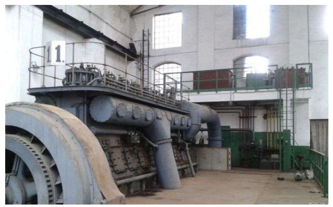
Figure 8. Interior photo - Museum of electric power station

An example of permanent investment is the rehabilitation and reconversion of a building dating since 1897, the electric power station of the entire mining area from Banat. In 1966, because of the technical and moral wear, the power station ceases its activity. Another few years ago, the power station worked only as a transformation point, but the machinery inside it are objects on the list of historical monuments in Romania, as objectives of national importance. Nowadays, after the imminent closure of the coal mine, the electric power station has undergone changes for reconversion and became a museum.