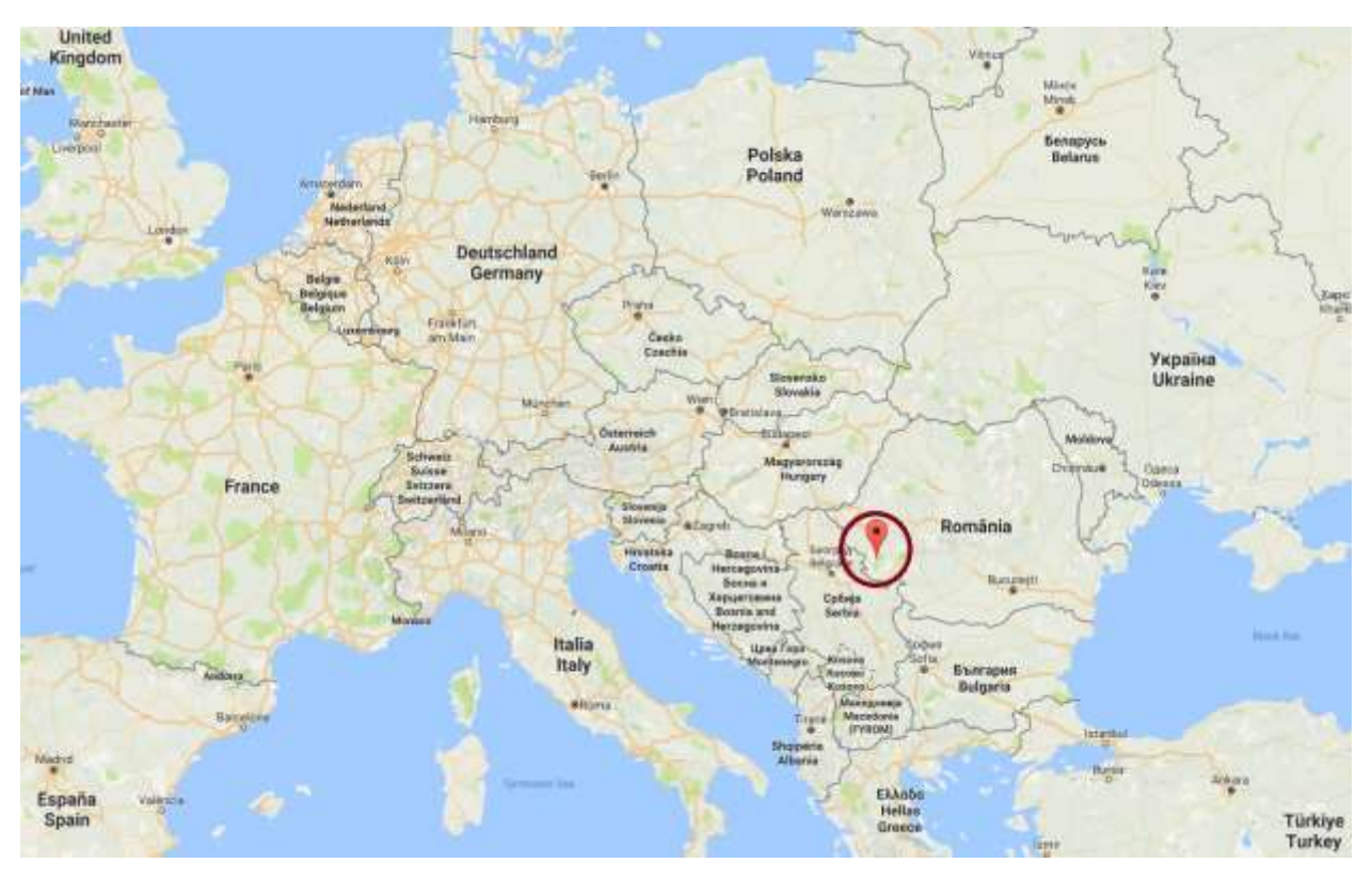
Figure 2 Anina's location in European context [3]

Selariu A., Agachi, M.I.M. / Acta Technica Napocensis: Civil Engineering & Architecture Vol. 60 No 3 (2017) 88-100