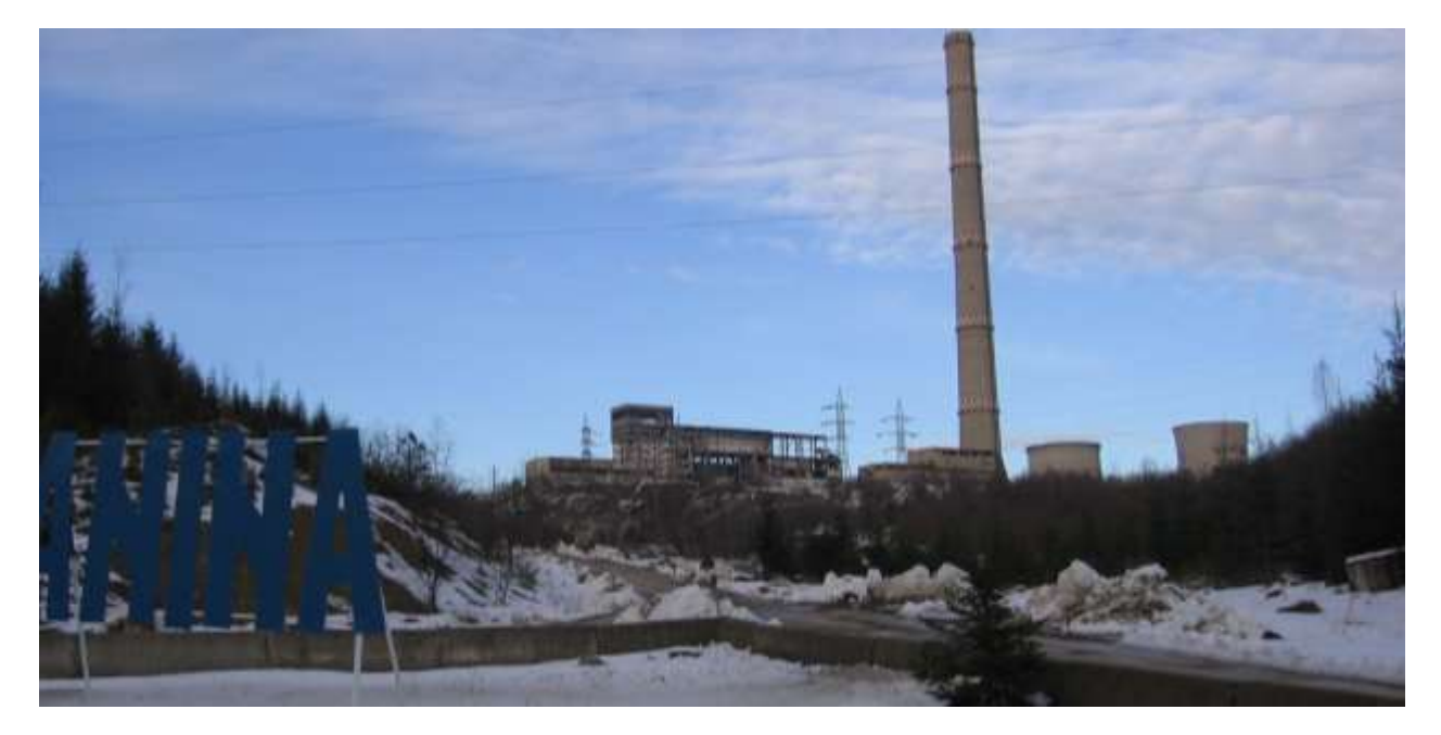
Figure 5. The thermal power station form Crivina – Anina [6]

Anina has become an interesting study area because of the many identity elements as: the thermal power station from Crivina (Anina) considered one of the biggest and the most unprofitable project of the dictator Ceauşescu, and before that the Sommerfriche resort, made by the Austro-Hungarian Empire. Anina was an important metallurgical and energetical settlement in the context of StEG (the acronym for the "Kaiserliche und königliche privilegierte österreichische Staats Eisenbahn Gesellschaft", an Austrian-French company, founded in 1834 in Vienna, which built the first railways from Banat and Romania today and owned, until the First World War, a large part of the mountain Banat) [5]. Anina, a famous mining area, it still has an various natural resources and a good quality of coal found in the depth of the exploitation wells. All of this and much more challenges to to a complex study of this area.