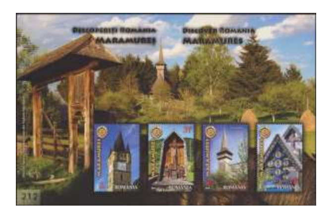
Figure 8. Discover Romania - Maramureş (2014) [6, 14]

Also concerning the architecture, in Maramureş, for example, wood has always been a resource used in multiple ways: from the plate from which people eat to the shelter which protects the villagers, and the wooden churches in which they worship. When the people of Maramureş smell wood, they feel at home. The wooden gates are symbols of the Maramureş village, also considered the Land of Wooden Churches. The themes carved in the poles of the gates shows a symbolic territory located between the outer world and the homestead, between the neutral space and the sacred realm, their role being to protect the house and the family (Fig. 8).