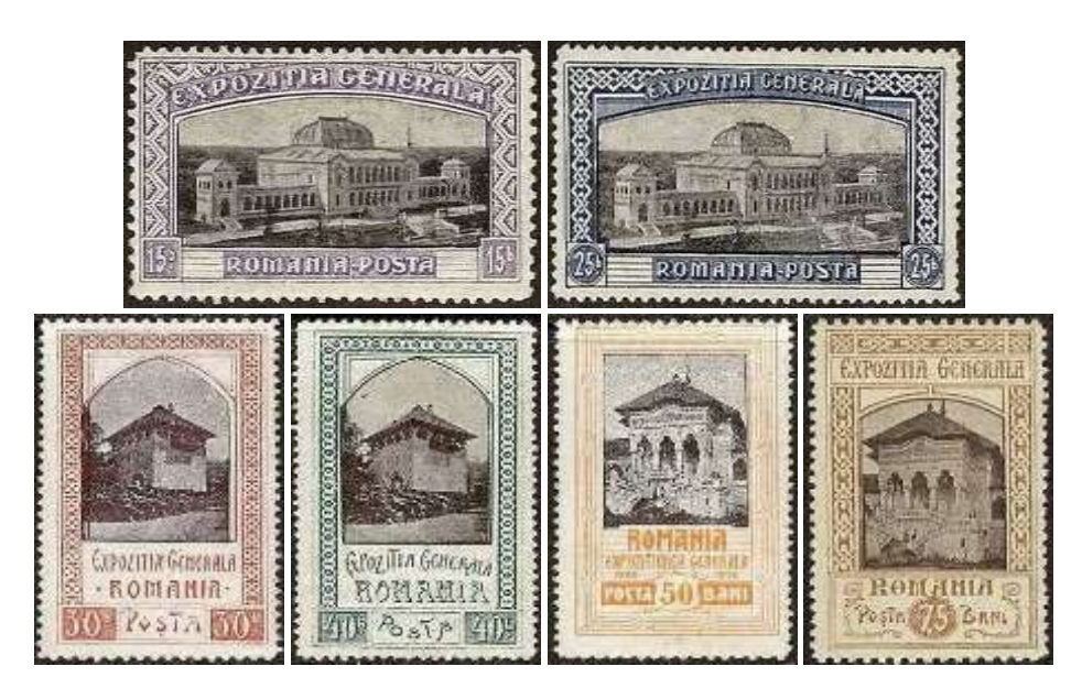
Figure 1. General Exhibition - Bucharest (1906) [2, 5, 7]

The Romanian philately, since its inception, has made known to the world the elements of local architecture, which we place as the foundation of the ecological house concept [3]. Through this paper, we want to present to the public a series of philatelic issues that have traditionally established the Romanian architecture in more than a century. In this context, we mention the first philatelic issue, appeared in October 1906 at the "General Exhibition held in Bucharest" (Fig. 1), in which are explicitly mentioned elements of architecture.