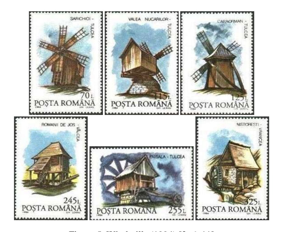
Figure 5. Windmills (1994) [2, 6, 11]