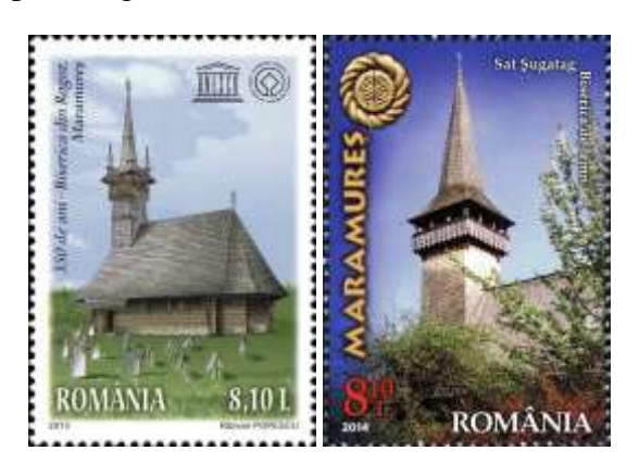
Figure 10. Wooden church, Rogoz (2013) and Wooden church, Sugatag (2014) [6, 16]

Budești, Desești, Ieud, Plopiș, Poienile Izei, Rogoz and Şurdești, have been included on UNESCO World Heritage List (Fig. 9). The wooden churches are not only touristic attractions, they are also places of worship for the villagers, who, dressed in their traditional clothes, show up every Sunday morning to pray and pay respect (Fig. 10).