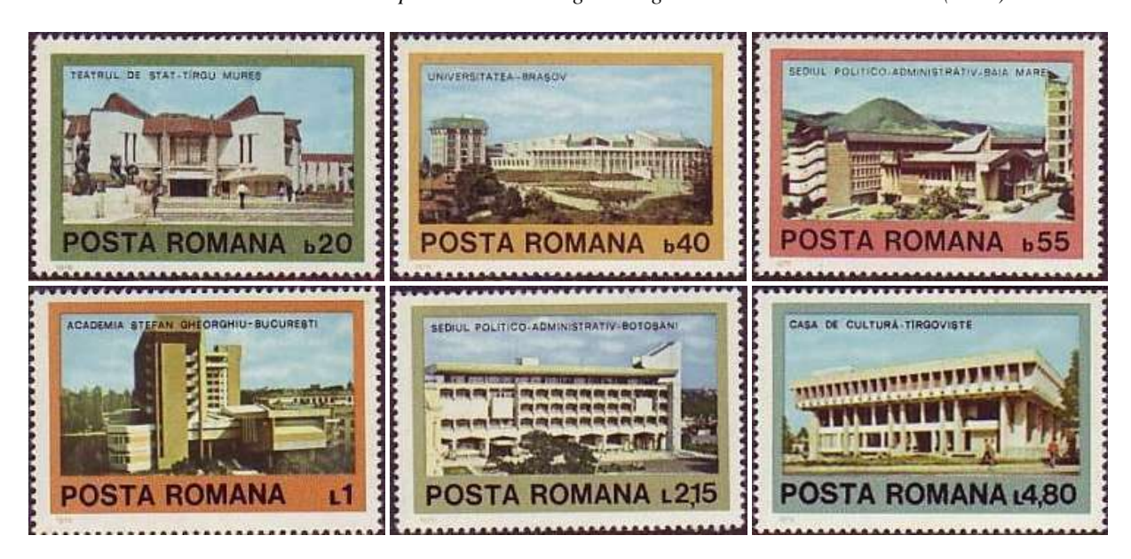
Figure 12. Modern architecture (1979) [5, 18]

Other representative buildings for Bucharest, Eforie Nord, Satu Mare, Târgoviște and Căciulata, we found in " InterEuropa " series starting with 18 May 1987 as presented in Fig. 13.