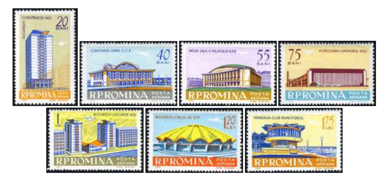
Figure 11. Romanian modern architecture (1961) [5, 17]

In addition to the philatelic issues, presenting the traditional architecture from Romania, there are a few series of filatelic pieces representing Romanian modern architecture. One of the first issue, in this context, "Romanian modern architecture" appeared in 20 November 1961 and contain stamps with reference to Bucharest - new construction, new homes and state circus, Constanta - railway station, the new Hall Palace, Hunedoara - new steel-mill, and Mangalia - workers club (Fig. 11).