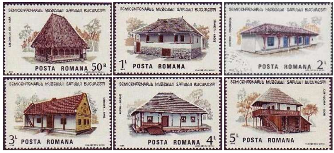
Figure 3. 50 years of Bucharest Village Museum (1986) [2, 5, 9]

As can be seen from the philatelic pieces presented in Fig. 2, the architecture specific to a certain place is influenced by a cumulus of factors, without any of them being determinant. By carefully analyzing the exposed stamps we will notice that the climate, building materials, economic motivations, culture and customs are the key elements around which the traditional Romanian architecture was built [2]. The house is, above all, a shelter against weathering: where the climate is warm and dry, high heat inertial materials that keep cool, the walls are painted white or in bright colors to reflect the radiation solar; where the climate is warm and humid, houses raised from the ground to avoid flooding are sometimes open or have thin walls that allow rapid ventilation; in the cold climate, the materials used are heavy and good thermal insulators, and the exterior is painted in dark colors that retain the heat.