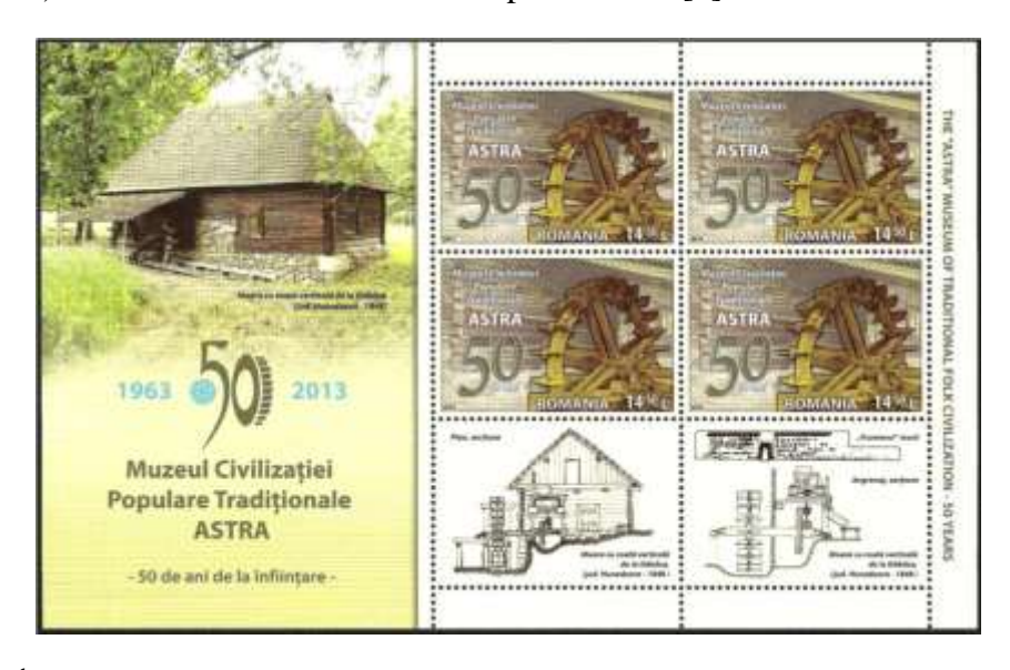
Figure 6. 50<sup>th</sup> Anniversary of ASTRA Traditional Folk Civilization Museum (2013) [2, 6, 12]

The next philatelic piece (Fig. 6), distinguished by its very representation, is the miniature of the commemorative "ASTRA 50<sup>th</sup> Anniversary Establishment Museum of Traditional Folk Civilization" (LP # 2001b). Appearing on 4 April 2013 and based on the offset lithography, the philatelic piece, in the same narrow frame, is drawing the vertical mill from Dăbâca (Hunedoara - 1848) - both the building itself (the illustrated cuff) as well as its interior, respectively the plan and the section of the gear (the vignette). The nominal value of the stamp is 14.5 lei [6].