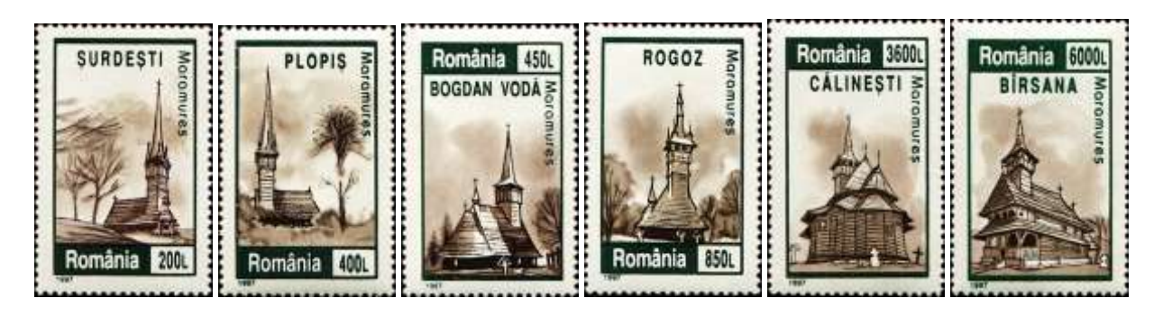
Figure 9. Maramures wooden churches from UNESCO World Heritage List (1997) [6, 15]

When you travel through small villages, you can easily notice how they preserve their old wooden church, a testament to local experienced builders. Eight of these monuments, located in Bârsana,