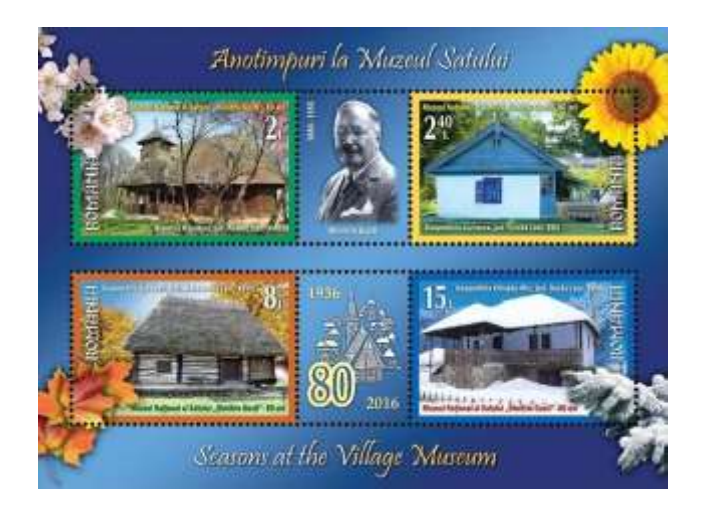
Figure 7. The block of 4 stamps - Seasons at the Village Museum (2016) [6, 13]

Also concerning the architecture, in Maramureş, for example, wood has always been a resource used in multiple ways: from the plate from which people eat to the shelter which protects the villagers, and the wooden churches in which they worship. When the people of Maramureş smell wood, they feel at home. The wooden gates are symbols of the Maramureş village, also considered the Land of Wooden Churches. The themes carved in the poles of the gates shows a symbolic territory located between the outer world and the homestead, between the neutral space and the sacred realm, their role being to protect the house and the family (Fig. 8).