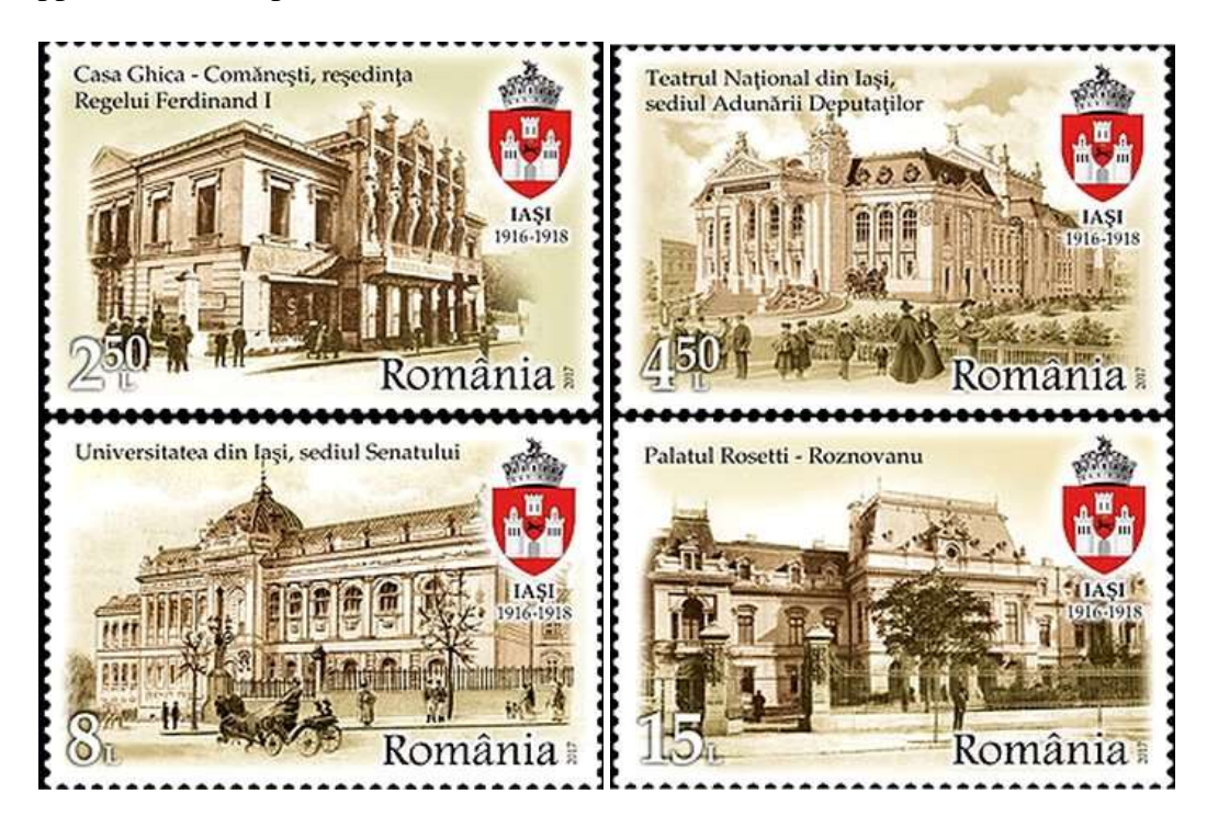
Figure 15. Iași - city of the Great Union (2017) [6, 21]

and the " Iaşi - city of the Great Union " (Fig. 15) with the 48x33 mm format stamps - Ghica House (Residence of King Ferdinand I), National Theatre, University of Iaşi and Rosetti-Roznovanu Palace - appeared on 26 April 2017 [6].