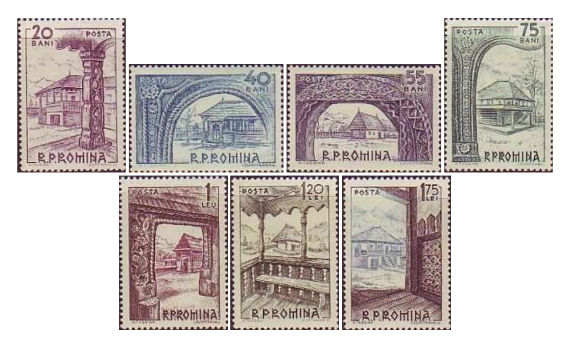
Figure 2. Village Museum - Bucharest (1963) [2, 5, 8]

The philatelic issue "Village Museum" appeared on 25 December 1963, consisting of 7 stamps made by Aida Tasgian after engravings by Ion Dumitrana (LP #575). The stamps illustrate houses from the Village Museum of Bucharest (Fig. 2). It can be seen how climate, materials, culture and people's habits have left their mark on the traditional architecture of the houses presented. Stamps have a 40x28 mm format and were printed in a 1,000,000 series run in 100-piece finished sheets. The philatelic issue is accompanied by 2 First Day Cover (FDC) pieces [5].