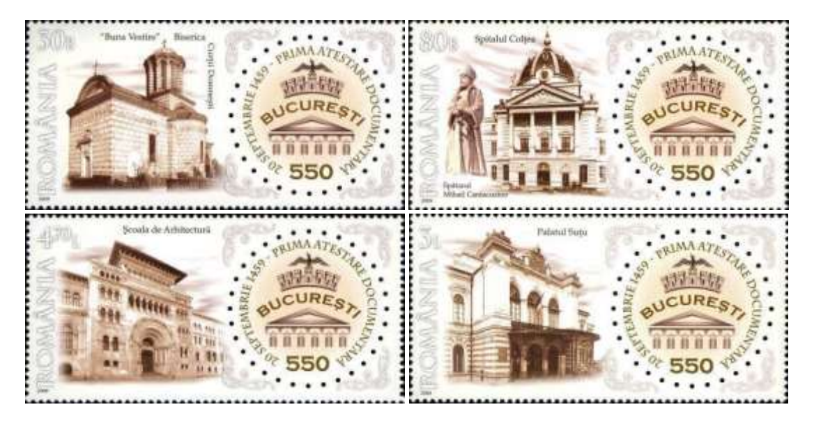
Figure 14. 550 years of Bucharest (2009) [6, 20]

and the " Iaşi - city of the Great Union " (Fig. 15) with the 48x33 mm format stamps - Ghica House (Residence of King Ferdinand I), National Theatre, University of Iaşi and Rosetti-Roznovanu Palace - appeared on 26 April 2017 [6].