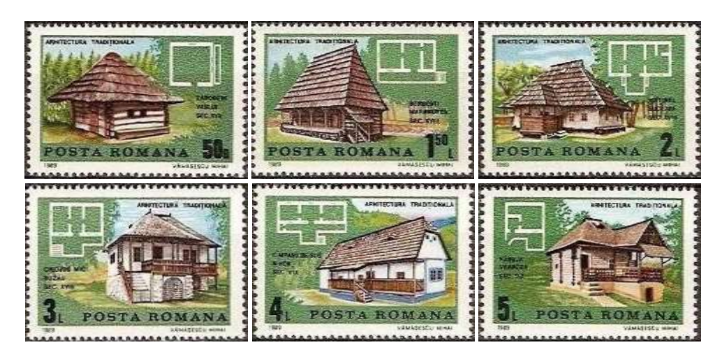
Figure 4. Traditional architecture (1989) [2, 5, 10]

There are many aspects of the local architectural specificity of a habituation area, by socio-cultural factors. Sometimes, cultural factors become more important than environmental determinants. The Romanian post office has successfully illustrated this idea in the philatelic issue entitled " Traditional Architecture " (Fig. 4), composed of 6 stamps made by Mihai Vamăescu, put into circulation on 18 February 1989 (LP #1215). It can be seen on each stamp the house plan specific to the architectural area. Stamps have a size of 27x42 mm and were printed in a 200,000 series run in 50-piece finished sheets. The philatelic issue is also accompanied by 2 FDCs [5].